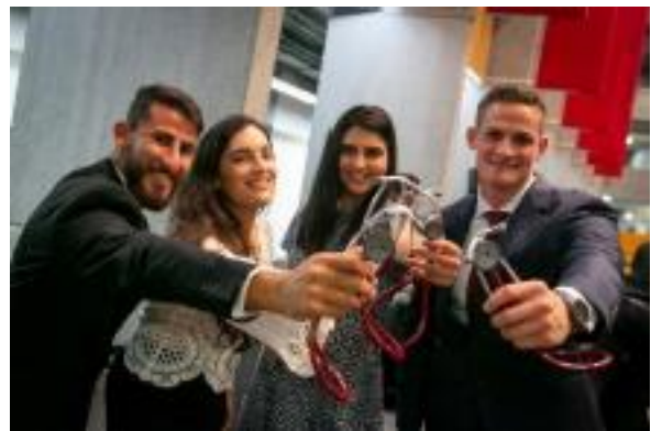
MD Welcome Event

Macquarie University encourages individuals from diverse educational backgrounds who will bring to the profession a variety of talents and interests. No preference is given to graduates with particular bachelor degrees. The GPA indicates the level of performance in the qualifying degree. There is no differentiation of GPA between institutions or programs.